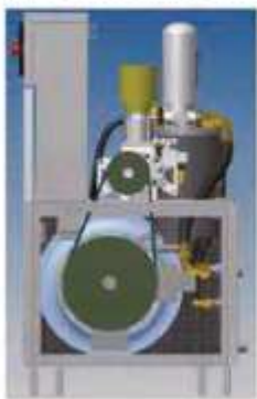
Belt Auto Tensioning system

The automate tensioning of the belt assures long life of the belt, less maintenance and noise reduction.