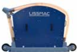
[ 1 ] Blade guard incl. vacuum shoe

Shift gearbox with 3 different rpm speeds – 950, 1620 and 2450 1/min, gearbox (clockwise/counter-clockwise rotation and neutral position), flange spraying system