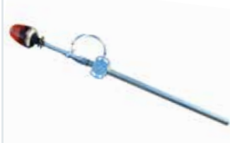
[ 3 ] Warning flasher