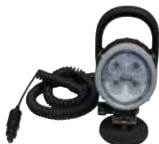
[ 2 ] Spot-light