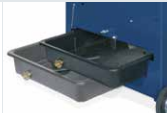
Water bath removable from the rear