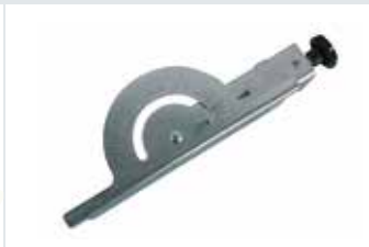
[ 2 ] Side stop