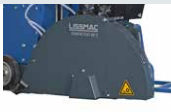
[ 2 ] Blade guard