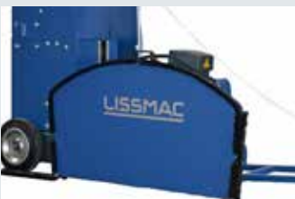
[ 3 ] Flush cutting blade guard