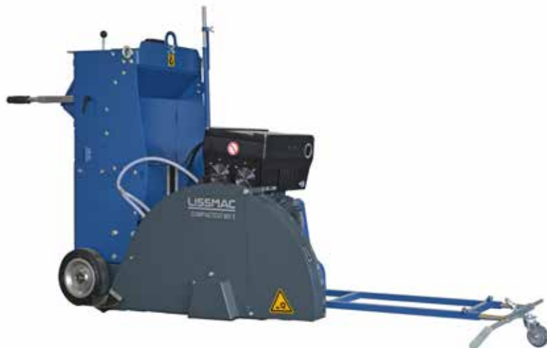
COMPACTCUT 601 E