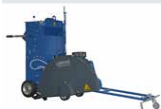
[ 1 ] COMPACTCUT 501 E