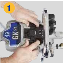
Slide & lift open access door