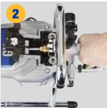
Remove pump section