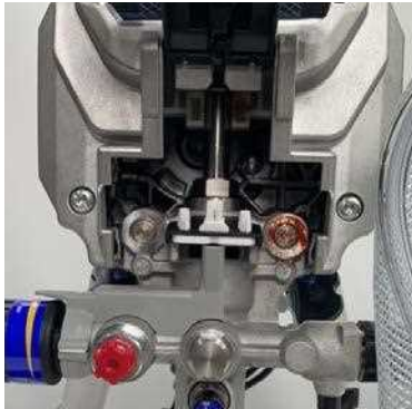
B ProXchange Pump replacement Fast and easy on-the-job