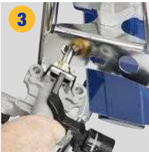
Use frame hex fitting to loosen pump and remove cartridge