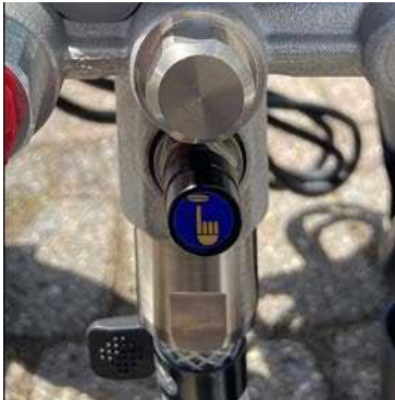
A Push Prime button Push-Prime button loosens stuck inlet check valve in case of priming issues