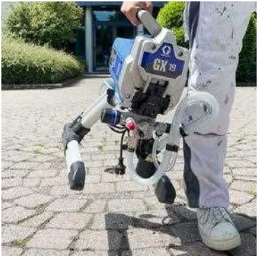
C Compact design Lighter than any competitive system