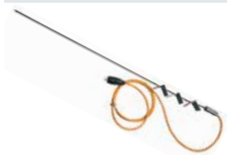
[ 1 ] Rod heater