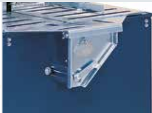
[ 2 ] Additional table